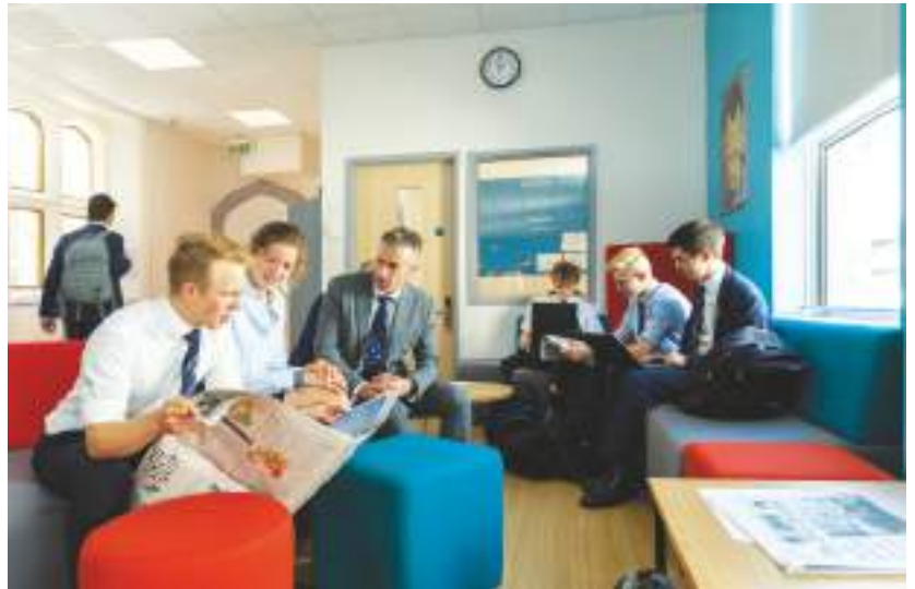
Top: Sixth Formers enjoy purpose-built facilities in the heart of Clifton Above: Catching up in the common room