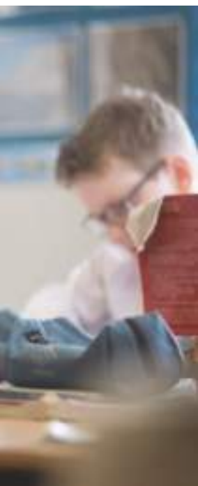
Bottom: Our co-ed Sixth Form