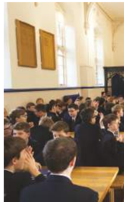
Bottom: Celebrating success at a weekly assembly