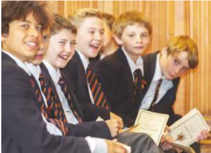
Top left: Mentoring by alumni Top right: House competition trophies Middle left: Solving a maths problem together Middle right: Celebrating success at Prize Giving Bottom: A-level chemistry students