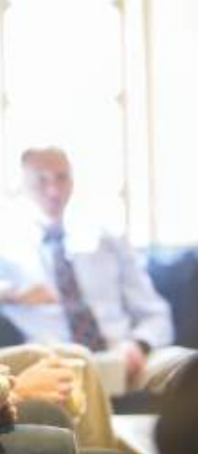
Top left: The happiest staff room in Bristol